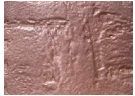
Copper B or C