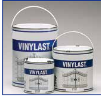
SUPPLIED IN 250ML, 1 LITER, 2.5 LITER, 5 LITER AND 20 LITER CONTAINERS